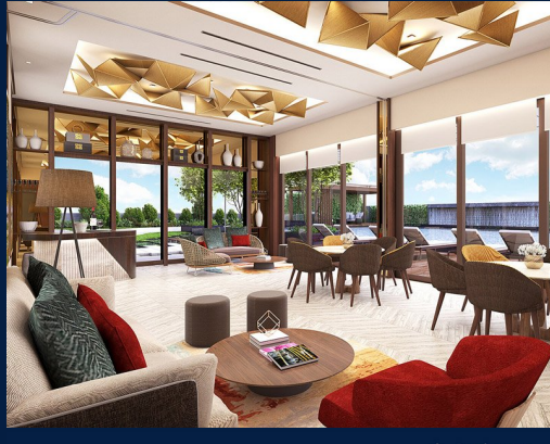
2 - Bedroom